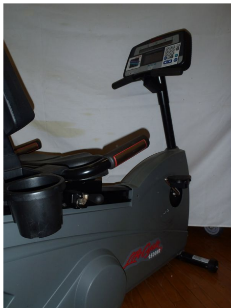
< 7. Life Fitness Recumbent Bike 9500 RHR Serial#661958 Condition: Fair (missing front wheel) Year Purchased: 2001 Minimum Bid: $50