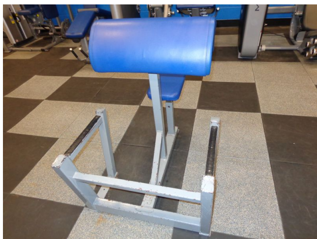
< 5. PYRAMID SEATED PREACHER CURL BENCH Serial# 9314067 Condition: Fair Year Purchased: 1993 Minimum Bid: $25