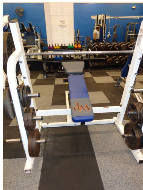
6. PARAMOUNT 3-WAY BENCH (Decline) > Serial# PFW-82 0105 027 Condition: Fair w/NEW Seat Pad Year Purchased: 2001 Minimum Bid: $25